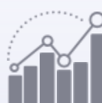
Analysis and Optimization