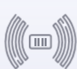
Scanless booking with Auto-ID