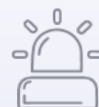
Alarms triggered by virtual Zones and Geofences