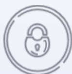
eKanban and Auto-Pull