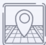
2D/3D Location & Navigation ( \pm 10\text{cm} Accuracy)