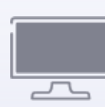
Interface for SAP/ WMS/ERP